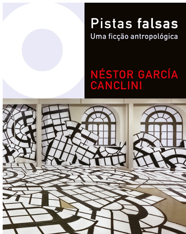
Cover of the Brazilian edition of Pistas Falsas (Instituto Itaú Cultural; Editora Iluminuras, 2020)