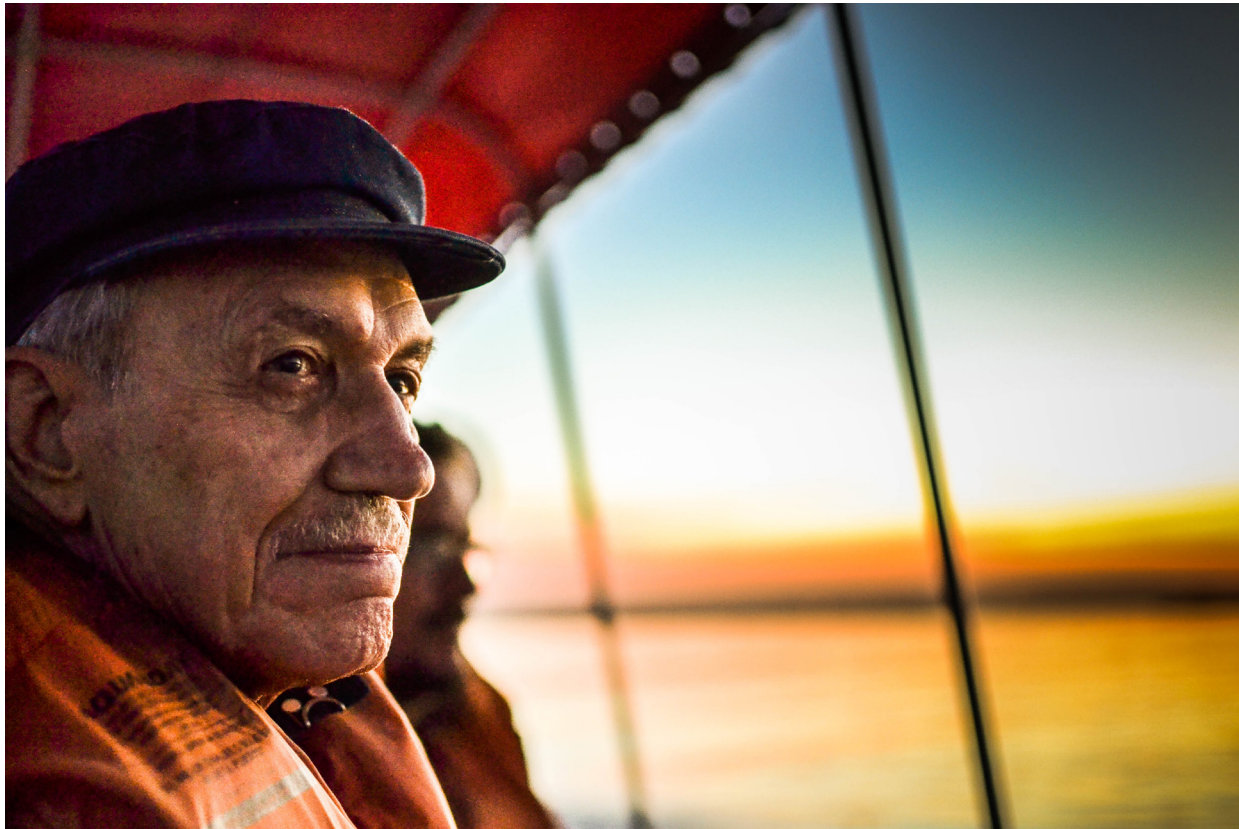
Photo of Néstor García Canclini, reproduced in Mexican edition of the book Pistas Falsas (Editorial Sexto Piso, 2018).

The photo above appears on the cover of the Mexican edition of Néstor Canclini's novel Pistas Falsas (False Leads), 2018, which I chose to help me navigate across this 'dark patch of jungle' in which I found myself when I accepted the challenging invitation to speak at this ceremony, an invitation which risked diverting me from the direct path, as it still does.