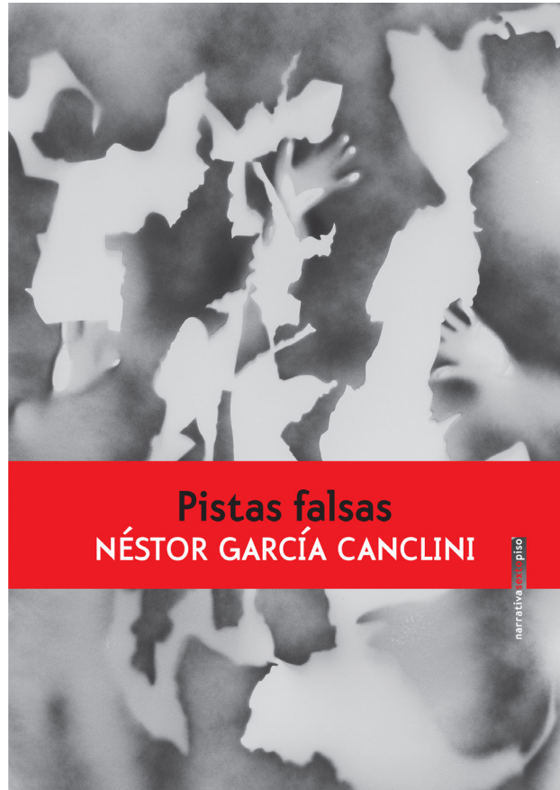
Cover of the Mexican edition of the book Pistas Falsas (Editorial Sexto Piso, 2018)